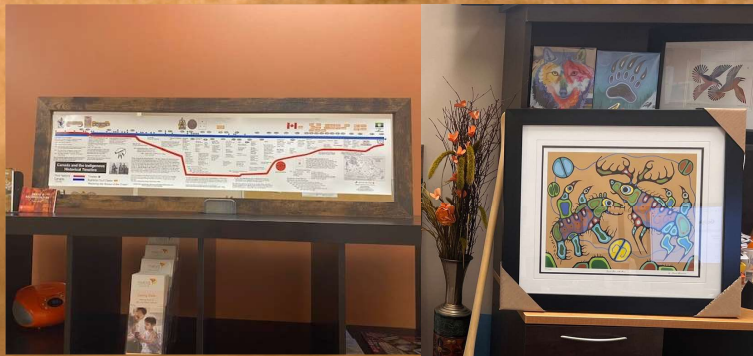
Picnic at Coronation Park

Our commitment to reconciliation activities continued this year with some important changes to our office environments as well as training opportunities for staff provided by Grandmother's Voice